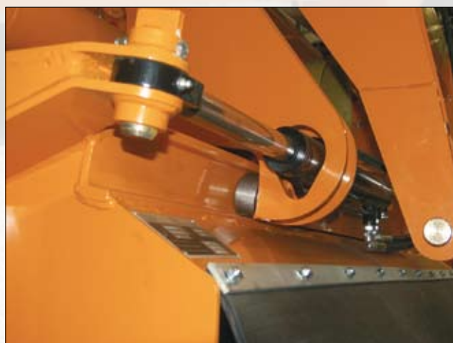
Rail construction with side shift