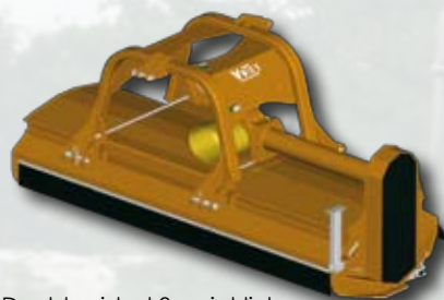
Double-sided 3-point linkage